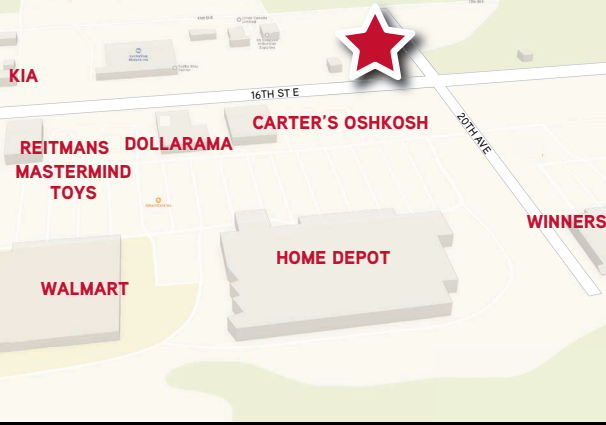
OWEN SOUND LOCATION MAP