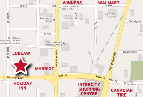
THUNDER BAY LOCATION MAP